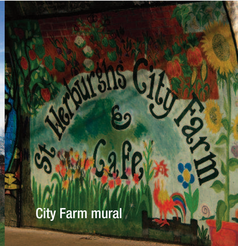
City Farm mural