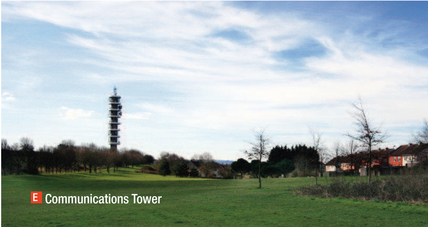
E Communications Tower