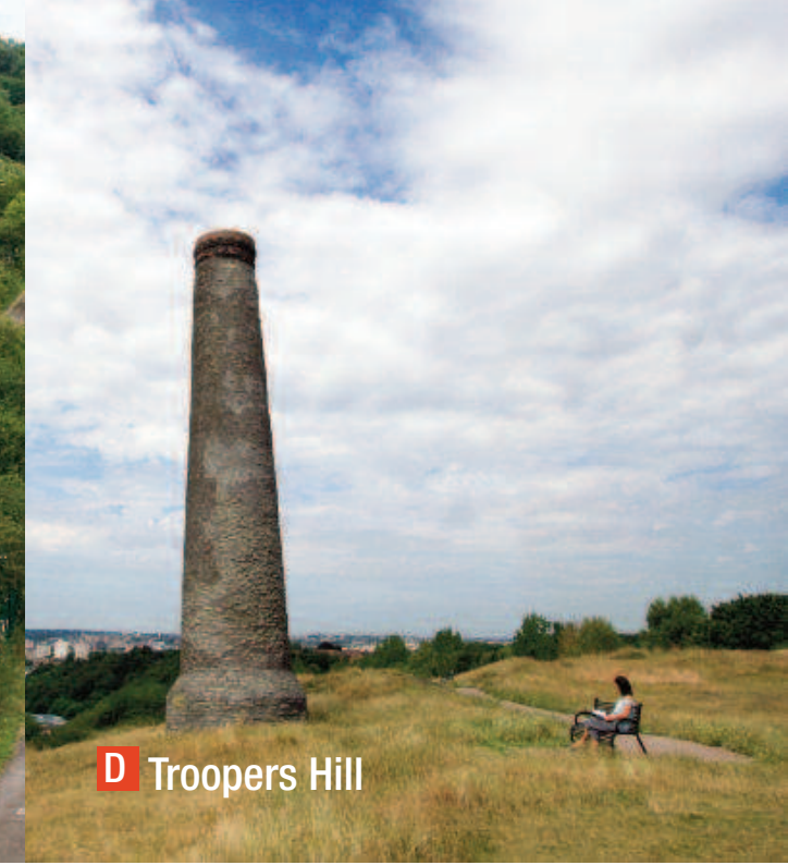
D Troopers Hill