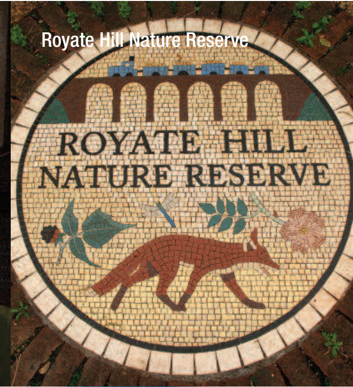
Royate Hill Nature Reserve