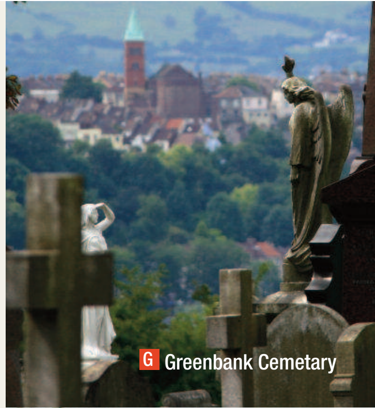
G Greenbank Cemetery