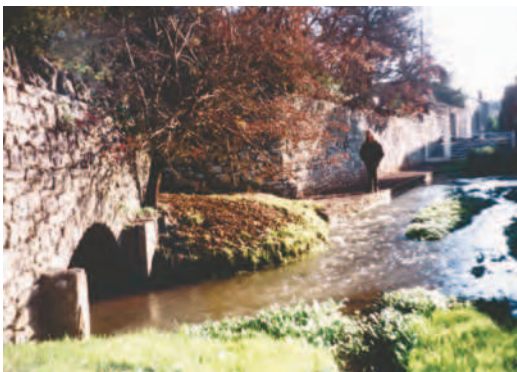
Bridge over river at Stockwood Vale